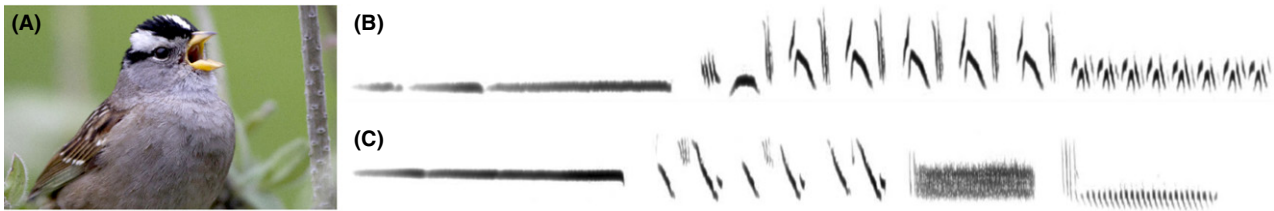
Fig. 1 (A) A male white-crowned sparrow singing. (B–C) Song variants from Lipshutz et al. (2017) sampled from neighbouring populations. The panels show song spectrograms – visual representations of sound – with time on the horizontal axis, note frequency along the vertical axis and amplitude denoted by the darkness of the lines.

alone (<300 km 2 ; Kroodsma 2005). In contrast, the song differences observed over large geographic regions (sometimes called ‘regiolects’) more likely evolved during periods of geographic isolation (Fig. 2). Yet, even studies at this broad scale between regiolects, in situations where we expect strong concordance between songs and genes – because both have diverged to a high degree – we find conflicting patterns. This conflict is illustrated by past work comparing the distinct songs of white-crowned sparrow subspecies.